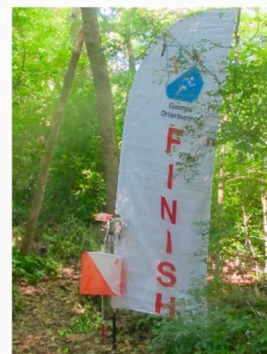
GAOC Starts Registration Statistics